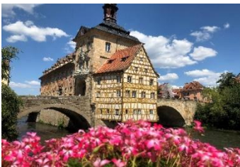
Bamberg's old City Hall

The second leg is another 90 miles to our lodgings. We will be sleeping inside the Fässla Brewery ! Turn in early or join us downstairs for some Franconian Specialties and some great Fässla Beer.